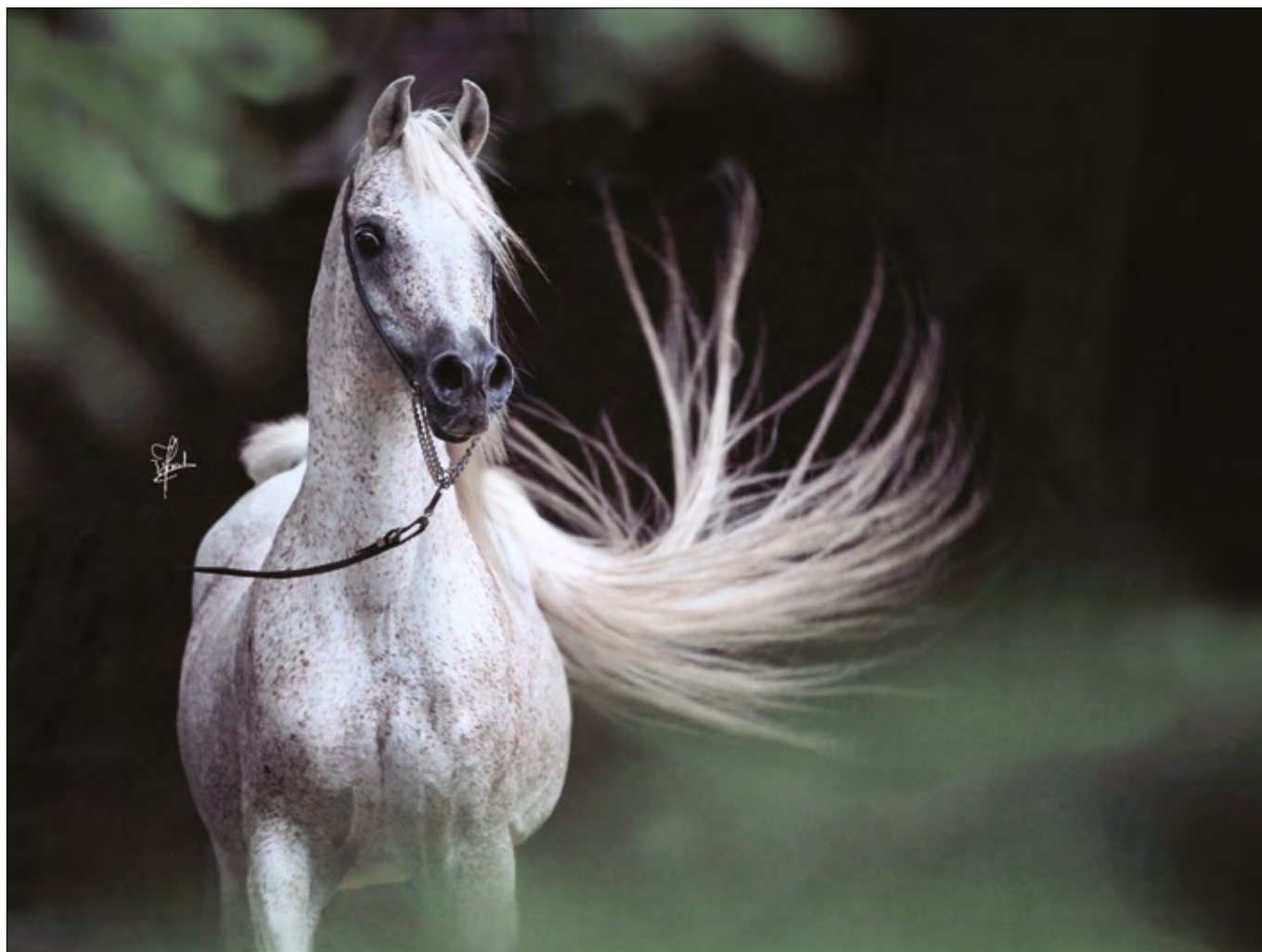
NK HAFID JAMIL ( Ibn Nejdj x Helala )