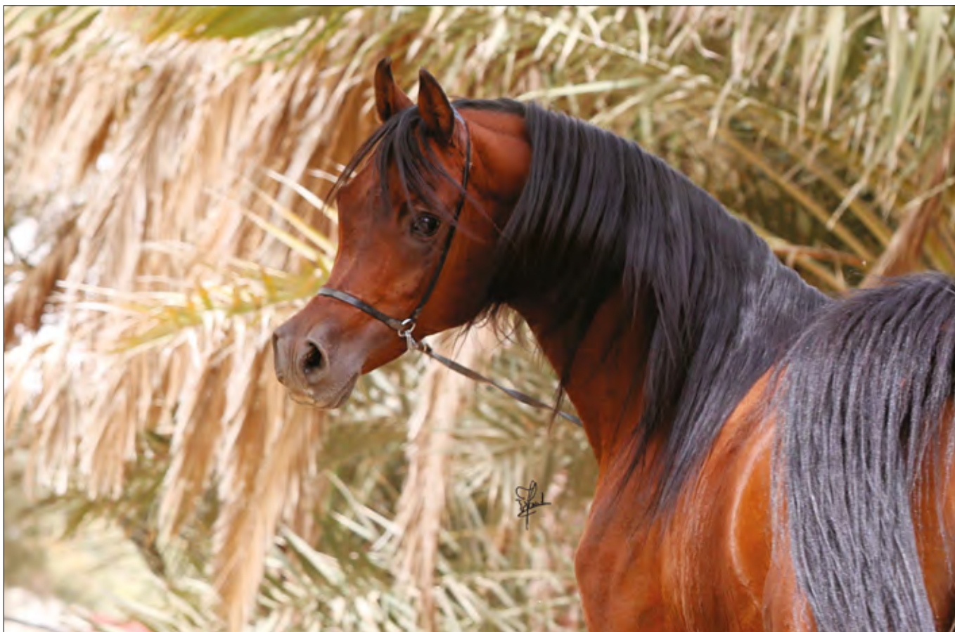
NK NABHAN ( NK Nadeer x NK Nerham )

for several years; then he moved back and forth between Katharinenhof and Al Nakeeb Stud in England. Later, he travelled to Saudi Arabia as a lease stallion, and then to Kuwait. He finally passed away in his home at the age of 20. Wherever he worked as a stallion, his children and grandchildren were highly appreciated, for breeding and at shows which are nowadays held with great passion in Arabian countries. His most internationally known daughter was NK Nakeebya, born at Katharinenhof and later one of the best broodmares in studs in Kuwait and Bahrain.