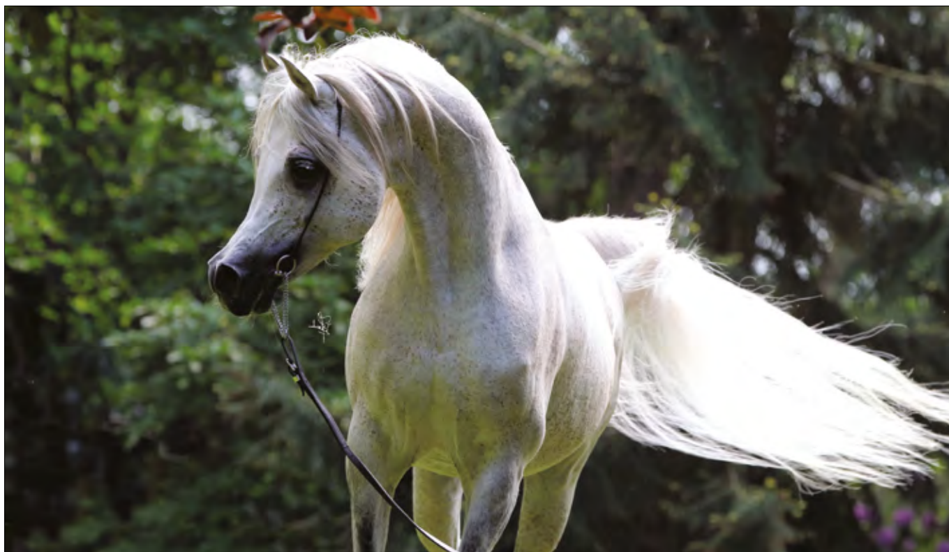
NK NADEER ( NK Hafid Jamil x NK Nadirah )

sloping shoulder and a well-shaped longer croup. Many Egyptian Arabians showed great weaknesses in just these two areas.