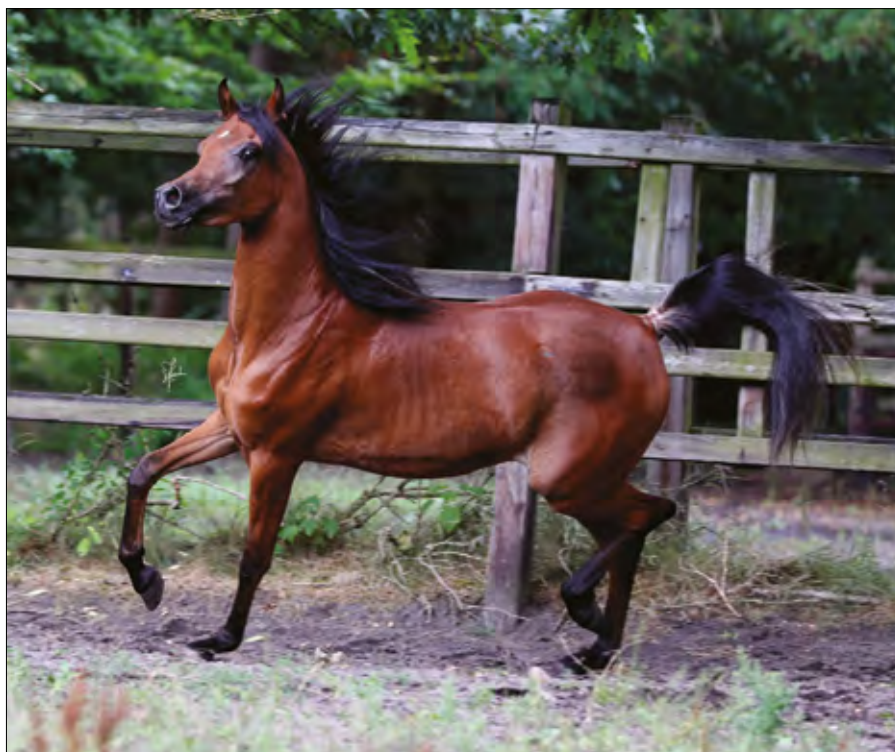
NK NAHLA ( NK Hafid Jamil x NK Nakibiya )