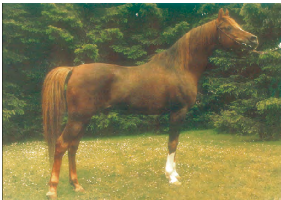
IBN GALAL (Magdi) ( Galal x Mohga )