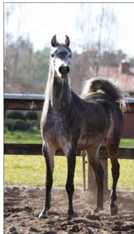
NK NAALA ( NK Nabhan x NK Nadirah )