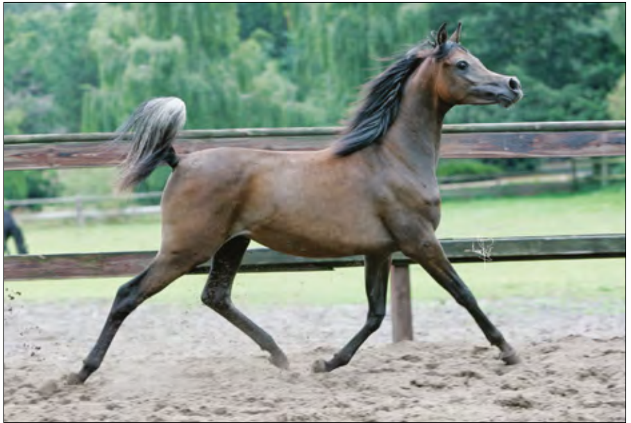
NK HABIBA ( NK Nadeer x Ansata Ken Ranya )