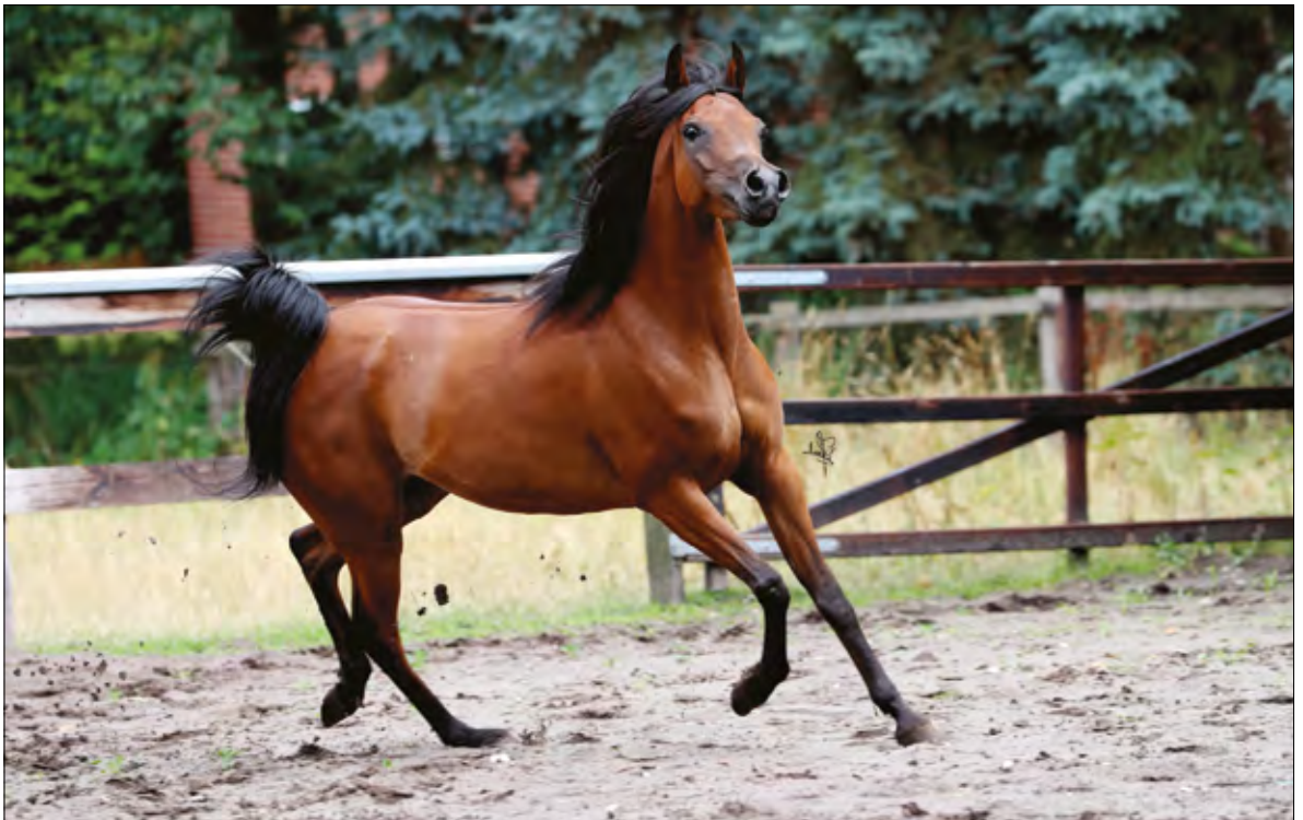
NK NAY (NK Nabham x NK Nawal)

brought about this change. NK Nabhan's sons and daughters wear predominantly a bay coat, some others are chestnuts or even blacks, like NK Naya, NK Nouna or NK Lamiya. This color development may superficially be perceived as nothing strange. However, this is far from it. Here the closed breeding program shows one of its effects. Through a constantly growing kinship linkage, colors and traits from the past are increasingly reappearing, which were covered up using the grey stallions and had only few chances to play a role in the past. Like the bay color of the foundation mare Hanan, the light chestnut color of the significant Nashua or the dark chestnut color of Alaa El Dine, after all the sire of three of the four original foundation mares. The color chromosome is one of the bigger chromosomes and in the process of reproduction these bigger ones are pulling with them more or less other chromosomes of different features, adjacent to them, into the new emerging chromosome combination. That means, other features