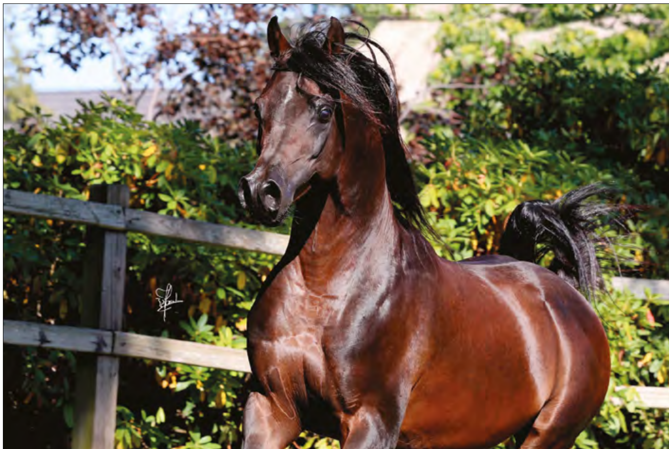
NK NIZAM ( NK Hafid Jamil x NK Nadirah )