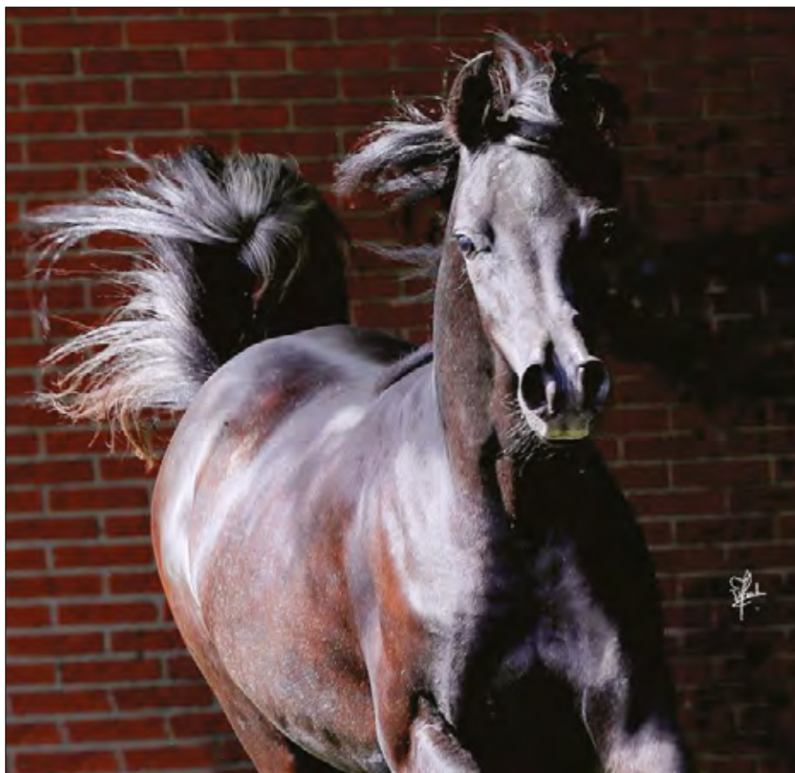
NK AMAL EL DINE (NK Nizam x NK Abla)