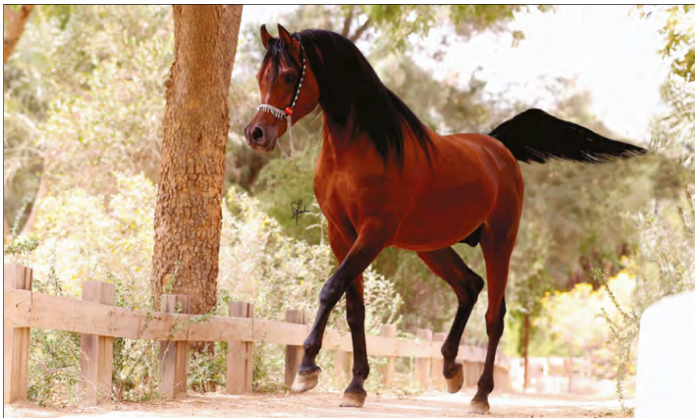
NK NABHAN (NK Nadeer x NK Nerham)