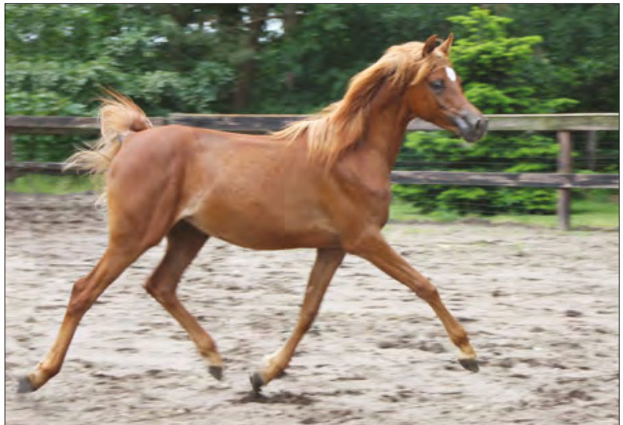
NK NINA ( NK Nadeer x NK Bint Nashua )

The last of these five grey stallions was NK Nadeer. It is certainly permissible to say he was the gentleman among them, truly a distinguished horse and the one with the most refined and benign demeanor; calm in breeding, neither wild nor impetuous, and when presented to visitors, he seemed to enjoy such a presentation and always kept himself under control.