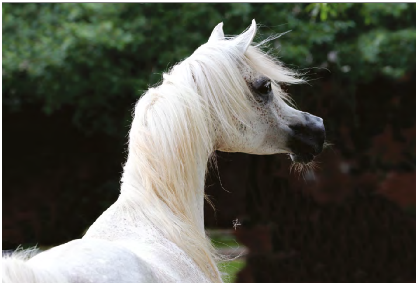
NK NAZLI ( NK Nadeer x NK Nasrin )

These five grey stallions, Jamil, Ansata Halim Shah, Salaa El Dine, NK Hafid Jamil and NK Nadeer, have been the ones who have determined the breeding activities at Katharinenhof over the past fifty years. They are the first to come to mind, when one thinks back over the years. Only then do the others emerge from the shadows of the past. One of these others was the chestnut stallion Ibn Galal, also an import from El Zahraa Stud in Egypt. He first worked as a stud stallion in Babolna, Hungary and for a time as a lease stallion at Katharinenhof, but was relatively quickly replaced by his son Ibn Galal I. As a leased stallion, he played a major role in the development of the fourth and last family, the “Siglawy” strain, with Mahiba, imported from Egypt. This was during the first decade of Katharinenhof Stud.