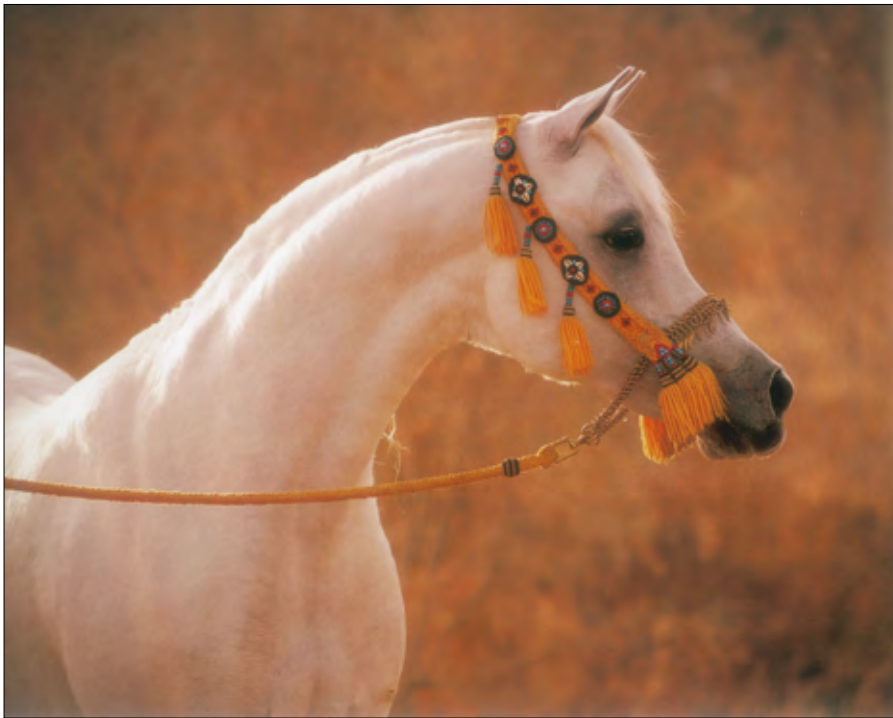
ANSATA HALIM SHAH ( Ansata Ibn Halima x Ansata Rosetta )