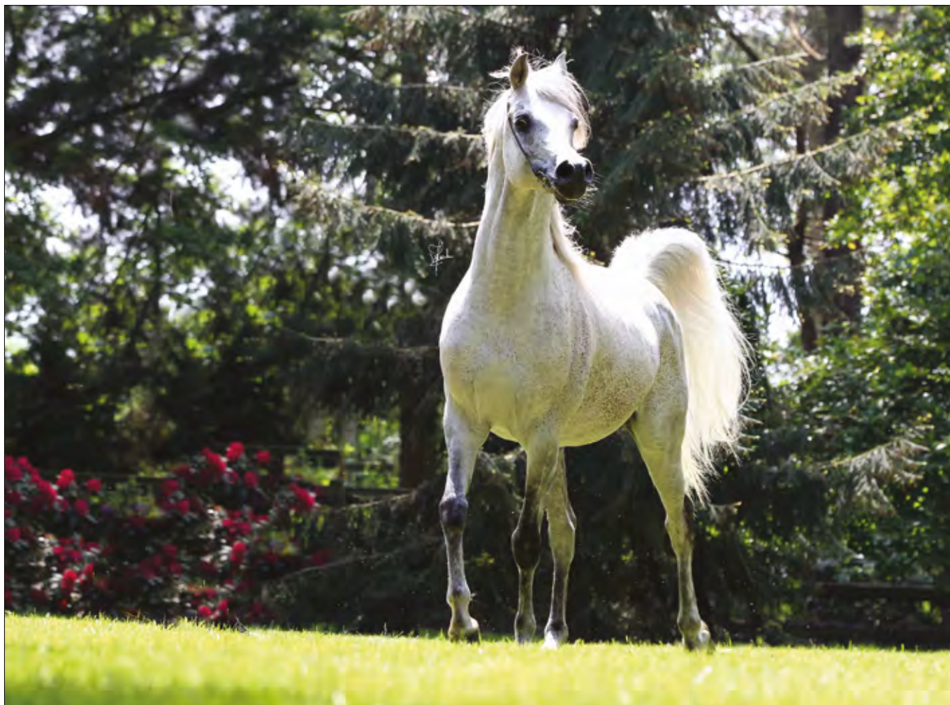
NK NADEER ( NK Hafid Jamil x NK Nadirah )

are connected to the color and with appearance of another color, also other features may appear as well. This brings a good refreshment into a population. The bay NK Nabhan, the son of NK Nadeer, stands as a perfect example: both its parents and grandparents are grey, he is however a bay and taller than all of them, the shape of his head different, his neck amazingly long and elegant and his top-line as desired. Thus, a change of color brought new possibilities for future breeding. NK Nadeer and also his son NK Nabhan, have substantially refreshed the breeding stock by adding a total of eight daughters to the population. A new generation of mares are testimony to a welcome positive change. NK Nadeer stands at the beginning of