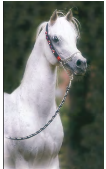
SALAA EL DINE ( Ansata Halim Shah x Hanan )

from Italy especially appreciated him as a sire, and for years the guest mare stable, at Katharinenhof was full.