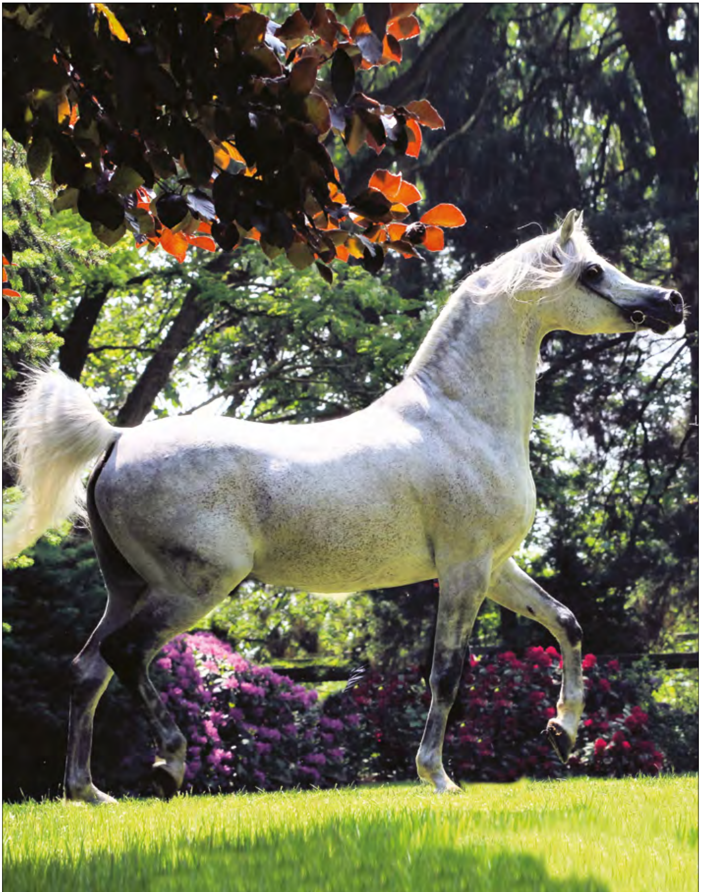
NK NADEER ( NK Hafid Jamil x NK Nadinah )